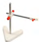
⑥ Filling Stand