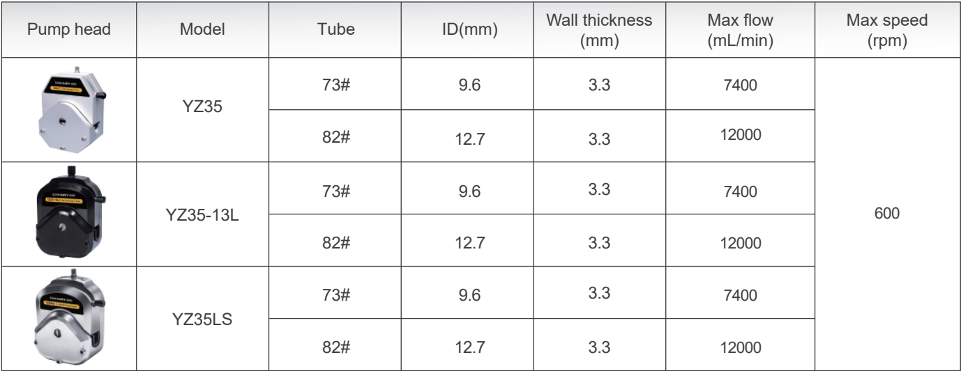
Pump head/hose flow parameter table: